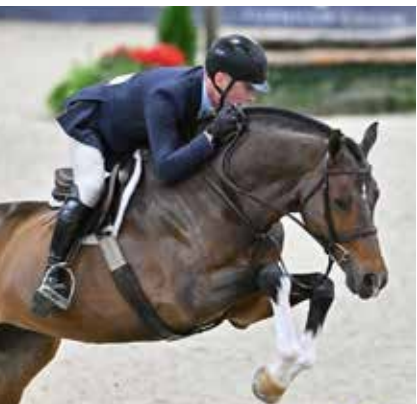
Capital Challenge September 29- October 5, 2025