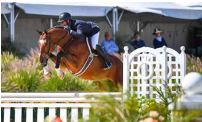
West Coast Spectacular March 12-16, 2025