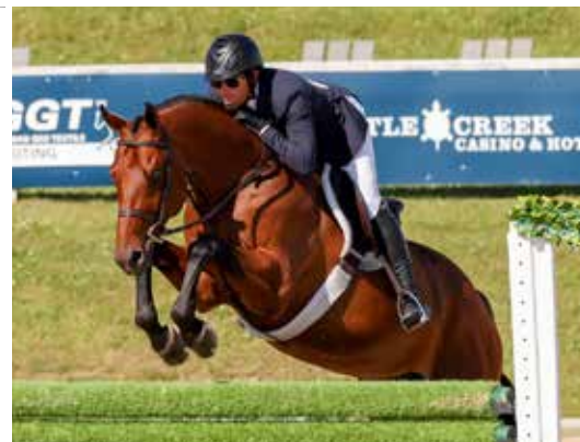
Central Spectacular TBD